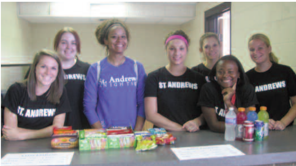
Members of the St. Andrews University Volleyball team volunteered at the Scotland High School concession stand in support of the high school's volleyball program. The monies raised will go toward the girls' off-season play in the Junior Olympic Volleyball Program.