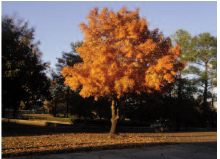
Fall Colors by Hope Beatson '12