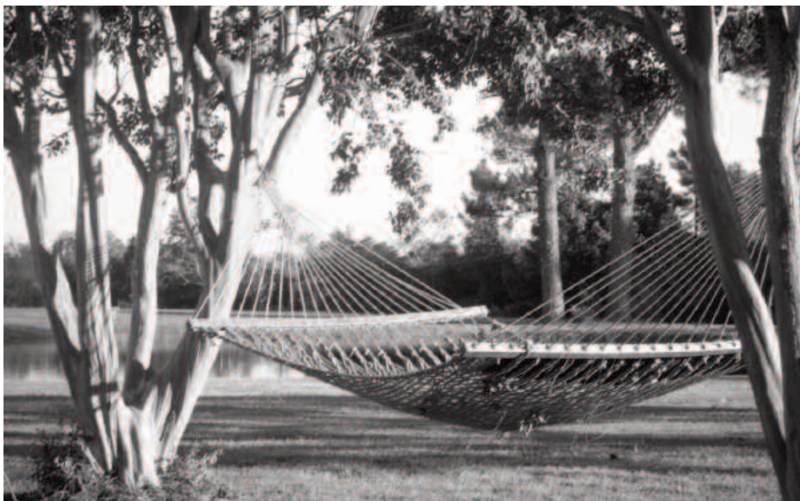
The Hammock By Hope Beatson '12