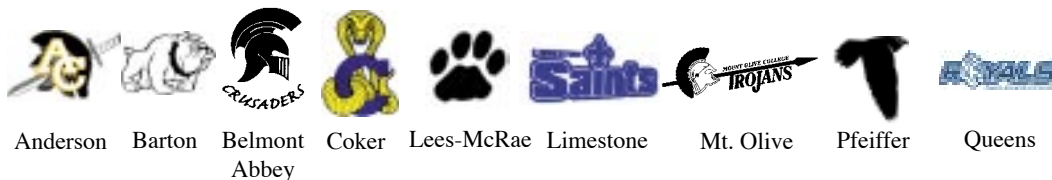
Anderson Barton Belmont Abbey Coker Lees-McRae Limestone Mt. Olive Pfeiffer Queens