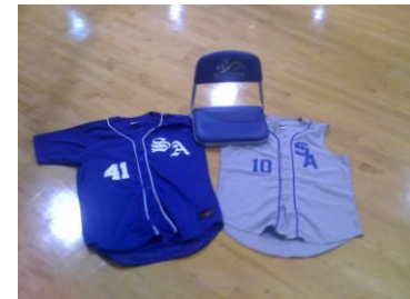
Available with Homerun Membership Package