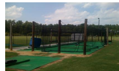
New Hitting Facility

Thank you for your consideration and support.